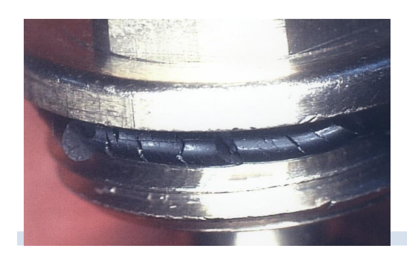
Figure 1: Pre-installed NBR O-Ring, severely cracked after several weeks of storage