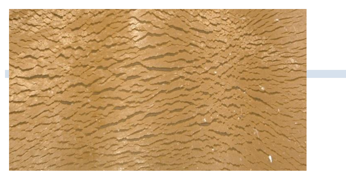
Figure 5: Cracks after chemical degradation (30x magnification)

O-Ring Prüflabor Richter GmbH Kleinbottwarer Str. 1 71723 Großbottwar