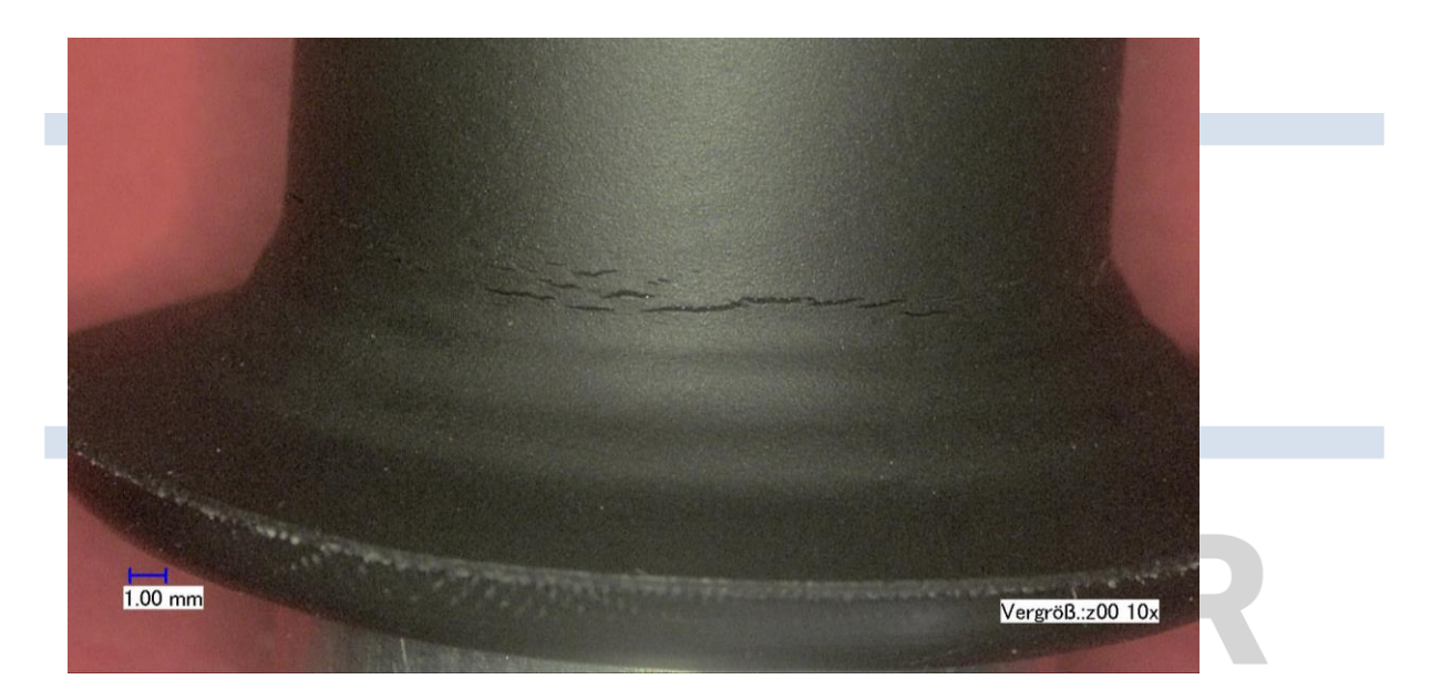
Figure 4: Fatigue cracking on FKM-membrane

The damage symptoms of ozone cracks resemble closely the damage symptoms of fatigue cracking by cyclical dynamic stress. If the history, or the kind of stress, is known, a clear differentiation is possible. The difference to chemical degradation is shown in the greater depth of cracks and in stress-dependent cracks, which appear usually in parallel alignment. Frequently, ozone cracks are found on pre-installed assemblies if they are exposed directly to ambient air during intermediate storage. Cracks can even develop after a few days.