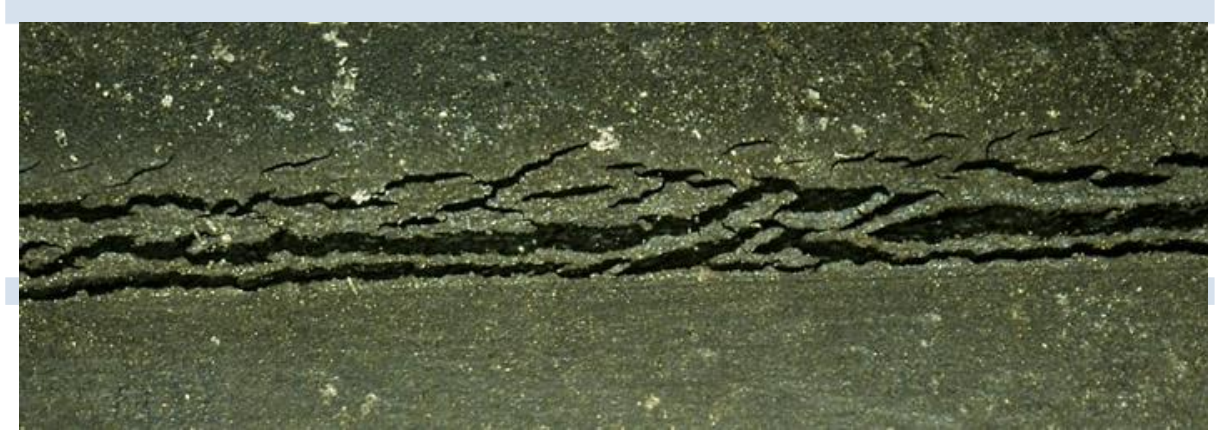
Figure 3: Cracks on a static pre-stretched bellow made of a BR/IR-elastomer