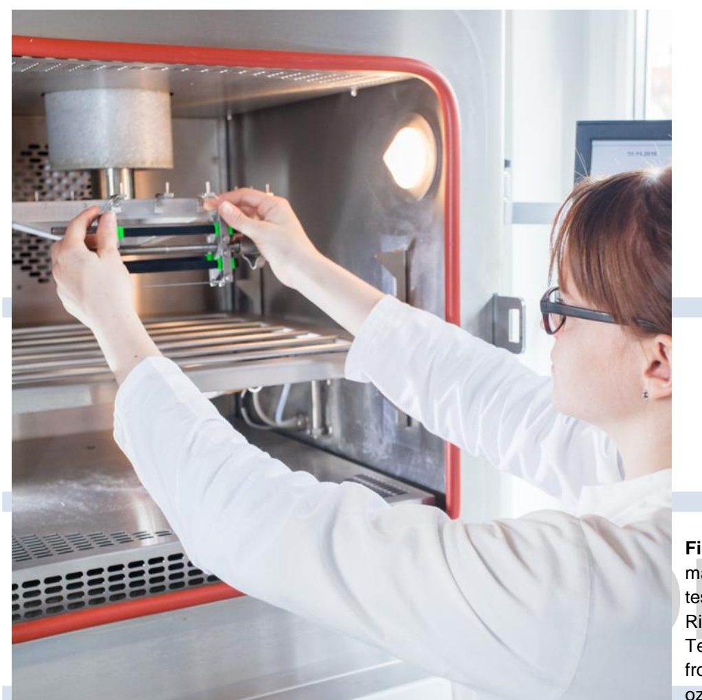
Figure 7: Performance of ozone test: Employee of Richter O-Ring Test Laboratory in front of an open ozone cabinet