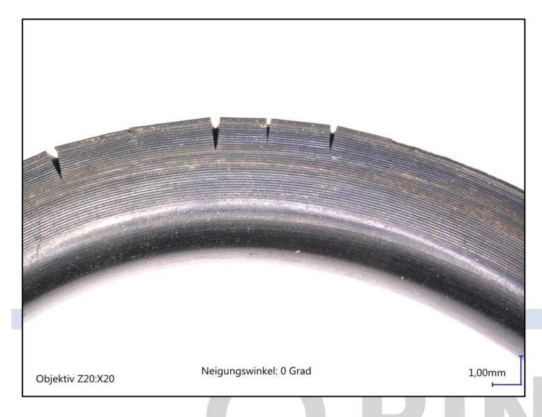
Figure 3: Brittle NBR O-ring shows cracks during bending (rotary scoring is an impression of the mating surface) Differentiation from ozone cracks: hardening of cracked zones. With ozone or fatigue cracking there are cracks in the still elastic elastomer matrix.

During long-term overheating - like an accelerated hot air aging - the seal is more likely damaged homogeneous. During a short-term overheating often only the area which was exposed to the excessive heat is damaged.