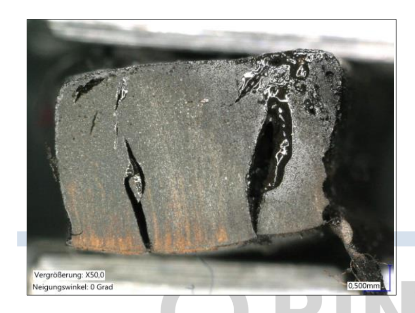
Fig. 3: Internal cracks due to explosive overheating or explo-sive evaporation

In many cases in explosive overheating, cracks are more numerous and smaller. The internal crack formation is typical for the damage mechanism of an explosive superheat.