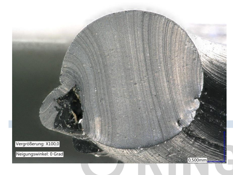
Fig. 3: O-ring cross-section after a groove overfill: On the left, the crushed area can be seen.

If the deformation is too large, stress cracks will appear inside the seal and then propagate outwards.