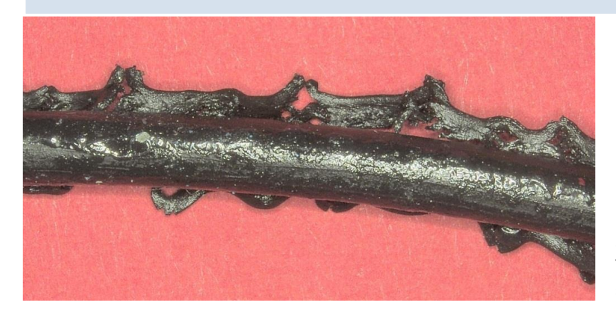
Fig. 2: O-ring cross-section after a typical groove overfill: The crushed areas can be seen above and below

A classic groove overfill can be recognized by crushed (already during assembly) or frayed edges. Material drives on both sides are typical for this type of damage.