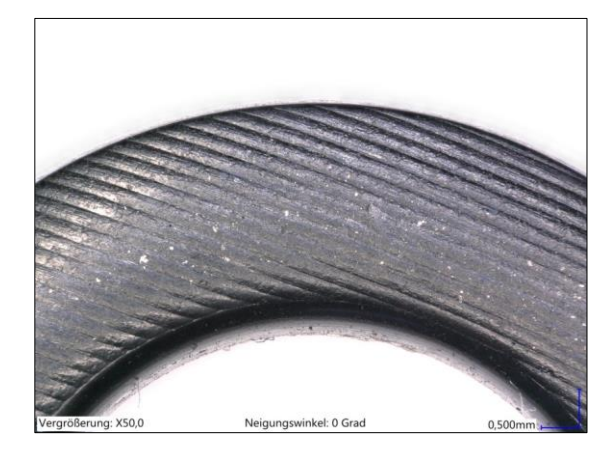
Fig. 7: This reason for failure due to an unsuitable surface structure of the groove can be clearly seen under the microscope, as the poor surface is visibly imprinted on the elastomer: The leakage is caused by the deep scoring in the groove.