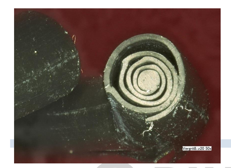
Fig. 1: Effect of a sharp-edged groove design. The O-ring peels off at the groove edge, here under the impact of 350 bar at a gap of 0.05 mm