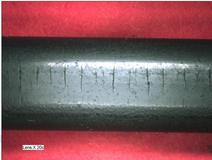
Fig. 1: Thermally damaged O-ring, completely hardened, cracks visible on contact surfaces during bending