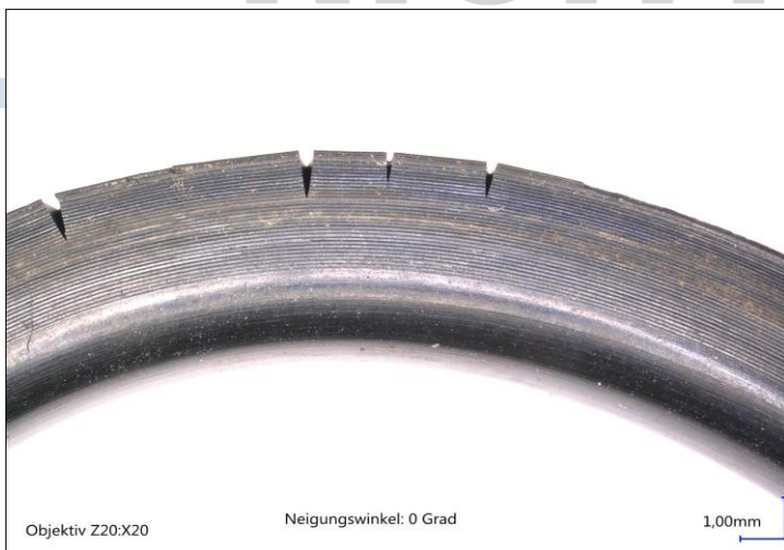
Fig. 3: This brittle NBR O-ring shows cracks during bending (circumferential grooves are an impression of the contact surface), differentiation from ozone cracks: Hardening of cracked zones. In the case of ozone or fatigue cracks, there are cracks in the elastomer matrix, which is still elastic here.