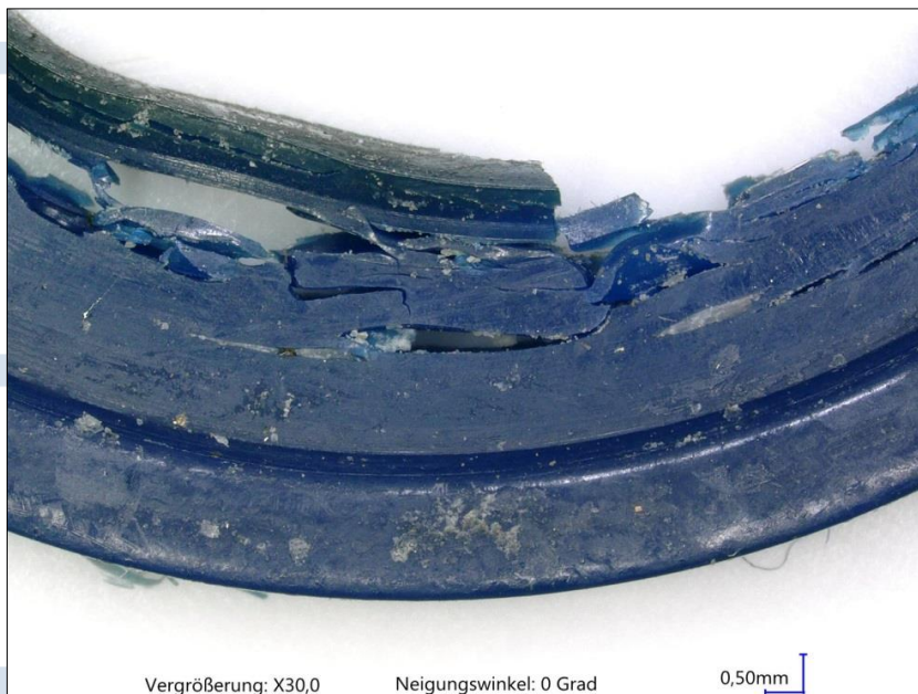
Fig. 3: Hydrolysis (= chemical degradation by water) of a polyurethane seal

The damage pattern of the chemical degradation is very similar to the damage pattern of aging by thermal overloading, see DICHT! 2/2017. In order to clearly distinguish chemical degradation from other damage mechanisms and determine the eroding medium, various analytical detection methods are available to the user today (e.g. GC-MS, FTIR analysis).